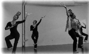
Drama Arts & Music