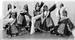
Tea, Chinese Opera, & Traditional Health Seminars