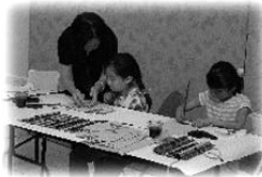
Traditional Chinese Painting